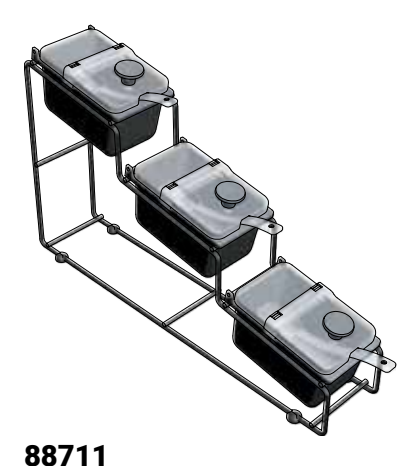
Includes (3) each combos of 1/9-jars, lids & spoons

1/9 SIZE LID 87253 1/9 SIZE JAR, 3.5" DEEP, BLACK 87202 SPOON, 1/2 OZ 85156